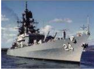
1975—Departing Pearl Harbor