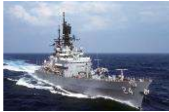
1985—Yokosuka from Australia