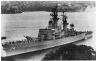
1968— Entering Sydney Harbor