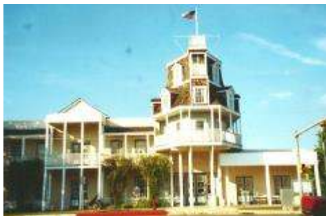
Admiral Nimitz Museum

As there are no plans for a dinner cruise, evenings are free to explore the many restaurants throughout the area. As done at past reunions, there will be a Welcome Reception in the Hospitality Room with a hosted bar and heavy hors d'oeuvres on Friday evening.