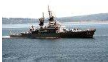
1992—Seattle Sea Fair Festival

Golf Shirts—all sizes ($20) + s/h (2XL/3XL- add $2)