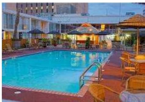
El Tropicano Pool

Since there is so much to do on the River Walk, and the nearby Downtown and Old Town (Mercado) areas, only one day trip is planned—to the National Museum of the Pacific War