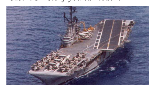
USS Yorktown circa late 1960s

For the Navy side, there is the Patriots Point Naval and Maritime Museum. Tour the USS Yorktown (CVA-10), USS Clamagore (SS-343), Medal of Honor Museum, Cold War Submarine Memorial and the only Vietnam Support Base Camp in the U.S. It's history you can touch.