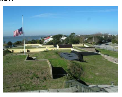
Fort Moultrie National Monument

One of the oldest colonial cities, (Charles Town, established in 1670) Charleston offers a glimpse of our colonial and antebellum past, the battle to keep us together as a young nation, and the reservoir of our earliest heritage.