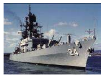
1975—Departing Pearl Harbor Golf Shirts ($20) + s/h (2XL/3XL-add $2)