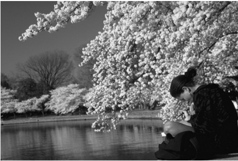
Cherry Blossoms on the Tidal Basin

Facility: The Holiday Inn National Airport/Crystal City will be our headquarters for our 2nd national reunion. We have a block of 30 rooms available from September 11th to September 15th.