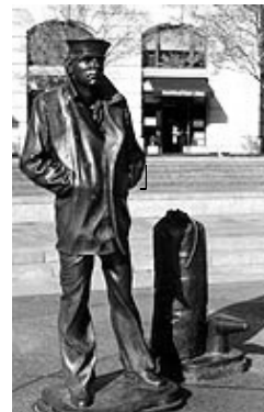
The Lone Sailor at the center of the Navy Memorial plaza.

More information for tour plans and all reunion details are found on Page 5 of this issue. A must read!