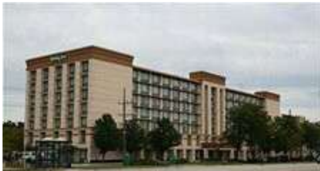
Holiday Inn Chicago Oak Brook

So, we've checked with booking and found that there are a few rooms available at the guaranteed $79 reunion rate. Call 630-833-3600 directly to speak with the hotel staff (not the national booking 800 number).