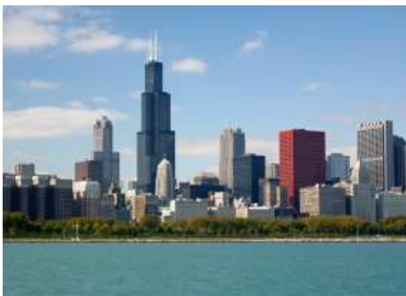
Chicago Skyline from Lake Michigan

Well, here we are, less than two months out from the Chicago reunion. What will make this mid-America reunion attractive to you? Well, let's try Location, Location, Location. Two years back, at our last D.C. reunion, we decided to change the