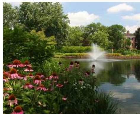
Cantigny Park, Oak Brook

On Friday, there's a caravan being organized by our President and other stalwarts for a visit to Great Lakes to see a graduation ceremony in the morning. It's a great chance to see the only remaining Recruit Training Center in the United States (and one I don't remotely recognize from my 1963 boot camp days—see the article in the last edition on You Can't Go Back).