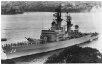
1968— Entering Sydney Harbor