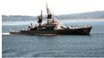
1992—Seattle Sea Fair Festival

Golf Shirts ($20) + s/h (2XL/3XL-add $2)