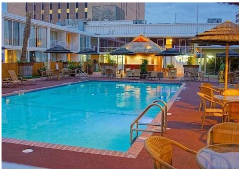
El Tropicano Pool

In a search of all of San Antonio venues, dealing with the CVB, and a conversation with HotelPlanners for the hotels alongside the River Walk and elsewhere in San Antonio in 2015, only one was able to accommodate us at a reasonable rate in the place we'd really like to be: El Tropicano River Walk Hotel .