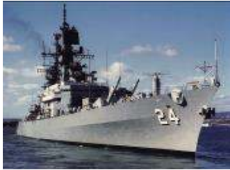
1975—Departing Pearl Harbor