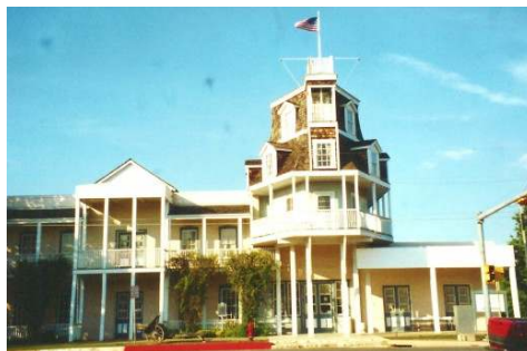
Admiral Nimitz Museum

Since there is so much to do on the River Walk, and the nearby Downtown and Old Town (Mercado) areas, only one day trip is planned—to the National Museum of the Pacific War (Admiral Nimitz Museum) in Fredericksburg. During the visit to Fredericksburg, there will be a memorial service to remember our shipmates who have already passed.