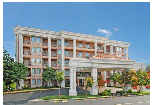
Clarion Hotel, Branson, Missouri