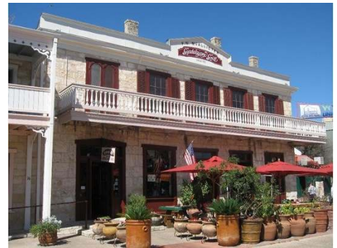
La Villita Restaurants

throughout the area. As done at past reunions, there will be a Welcome Reception in the Hospitality Room with hosted bar and heavy hors d'oeuvres on Friday evening.