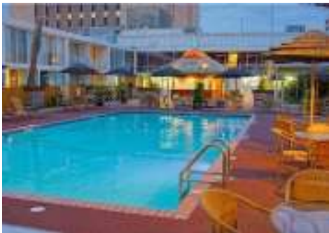
El Tropicano Pool

In a search of all of San Antonio venues, dealing with the CVB, and a conversation with HotelPlanners for the hotels alongside the River Walk and elsewhere in San Antonio in 2015, only one was able to accommodate us at a reasonable rate in the place we'd really like to be: El Tropicano River Walk Hotel .