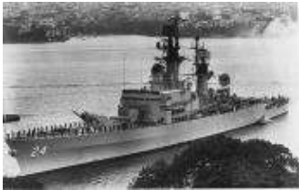
1968— Entering Sydney Harbor