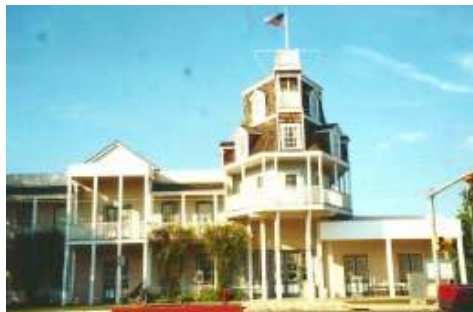
Admiral Nimitz Museum

Since there is so much to do on the River Walk, and the nearby Downtown and Old Town (Mercado) areas, only one day trip is planned—to the National Museum of the Pacific War (Admiral Nimitz Museum) in Fredericksburg. There will be more information in future issues of the newsletter.