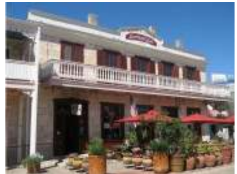
La Villita Restaurant

Thursday and Saturday evenings will be free to explore the